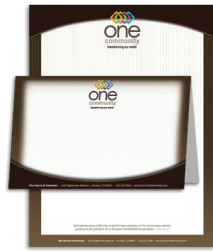
Newsletter or Q&A Shell 2-sided, 8.5 x 11 - folds to - 8.5 x 5.5