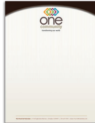
Letterhead 1-sided, 8.5 x 11