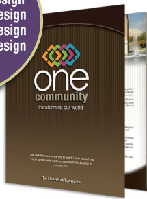
Case Statement 4-pages 17 x 11 - folds to - 8.5 x 11

Want EXPANDED materials and options? Scroll down to page 2.