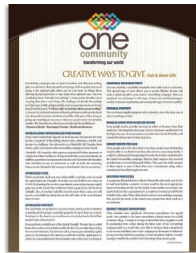
Creative Giving / What Gives? Sheet 2-sided, 8.5 x 11