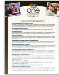
FAQ / Financial Goals Sheet 2-sided, 8.5 x 11